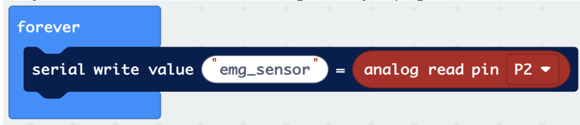
Figure 3. MakeCode program to record EMG data.