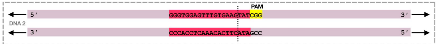
Target DNA 2