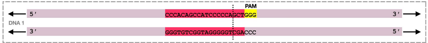
Target DNA 1

From HHMI BioInteractive: https://www.biointeractive.org/classroom-resources/building-paper-model-crispr-cas9