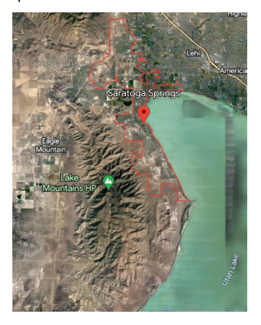
Figure 1: Map of Saratoga Springs, Google Earth