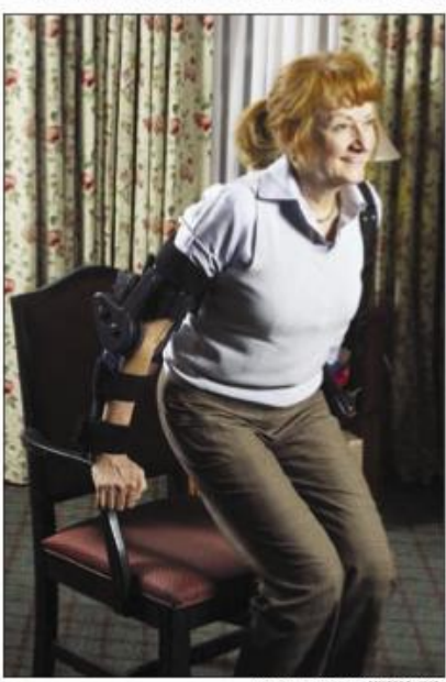
The device facilitates tricep extension to assist with functional exercises, such as sit to stand.

The robotic therapy device was one of the first