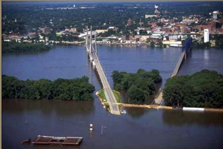
A flooded Mississippi River in Illinois, 1993.