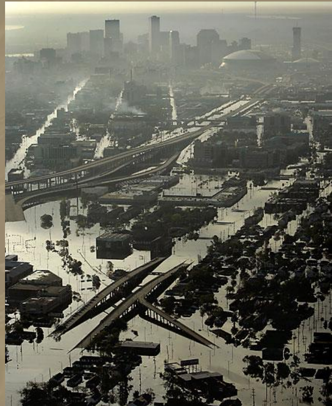
Downtown New Orleans after hurricane Katrina, 2005.