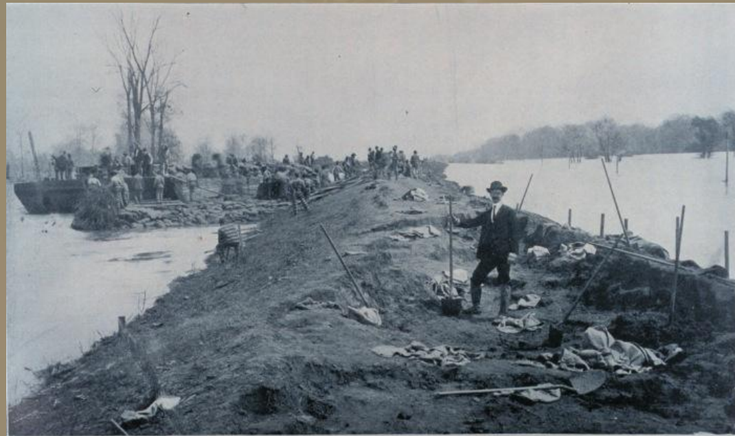
Repairing levee at Lagrange, Miss.

People with shovels repairing a Mississippi levee, 1903.